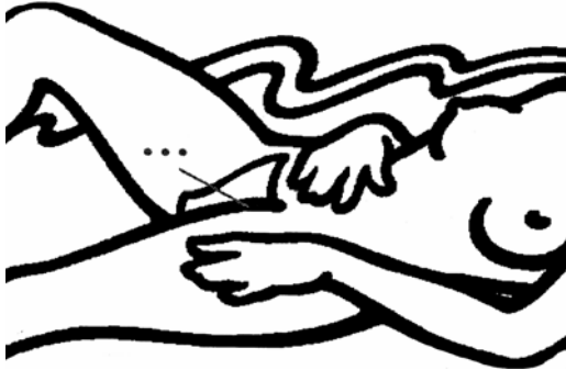
Barrier placement for oral/vaginal sex

Studies have shown that when Sheer Dams® are used correctly during oral-vaginal or oral-anal sex, they help reduce the risk of catching or spreading sexually transmitted diseases (STDs) such as herpes, gonorrhea, genital warts, syphilis, HIV or parasites. However, they do not completely eliminate the risk. Abstinence is the only sure form of prevention.